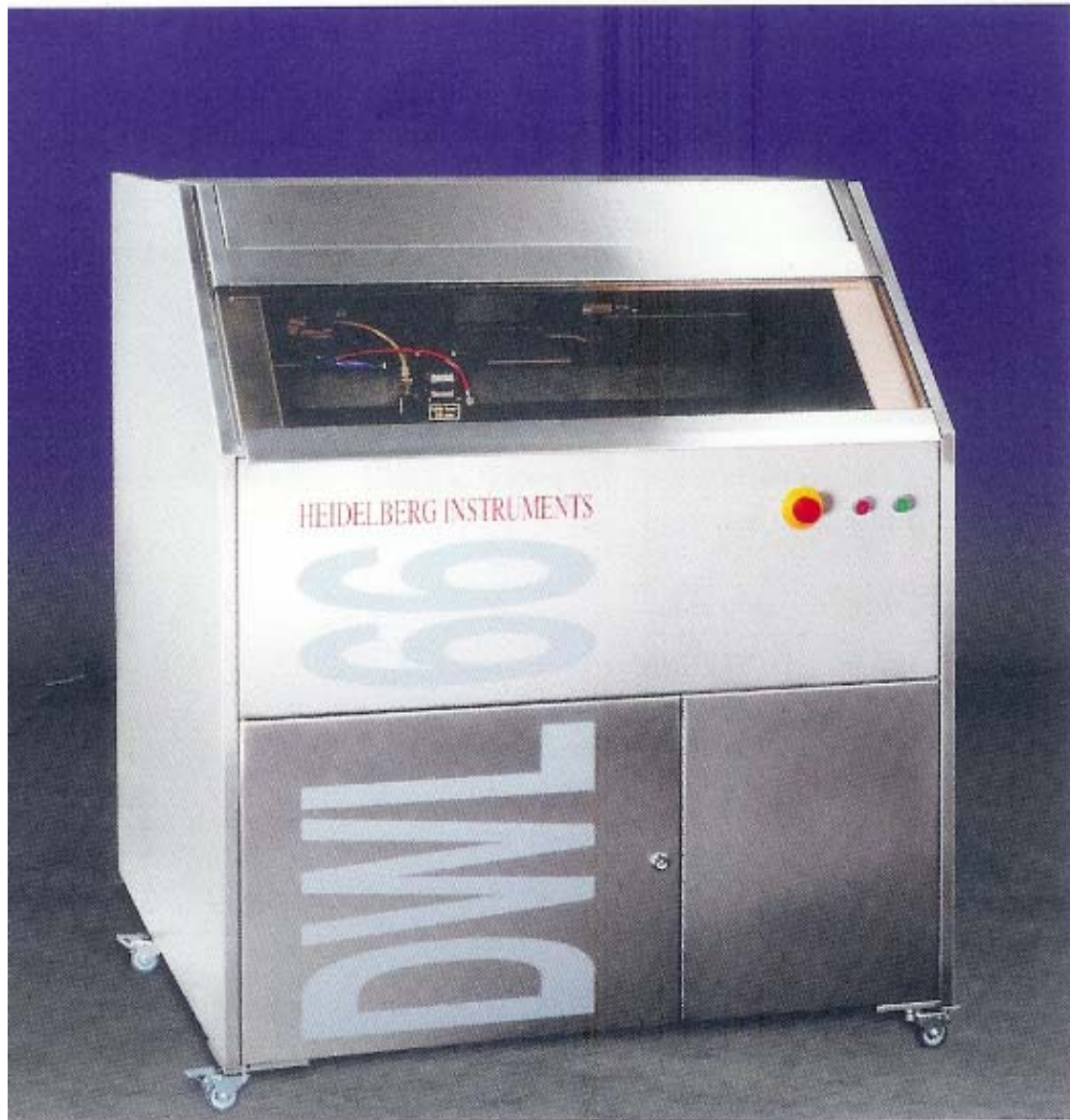
Scanned Photograph of DWL 66 Laser Writer System